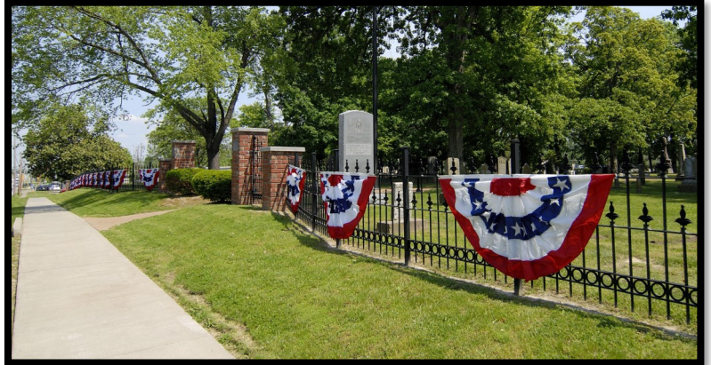
Woodlawn Cemetery entrance