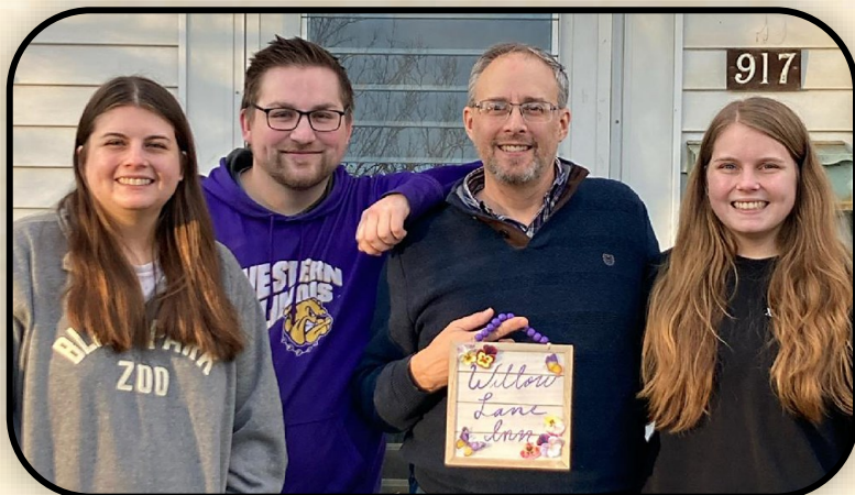
Photo taken in Peoria at the home that has been in the Coffey family for several generations.