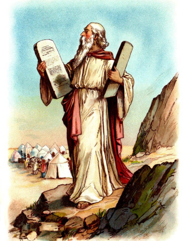
Moses with the Ten Commandments